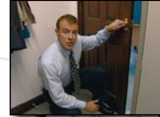
Fire Safety In The Workplace