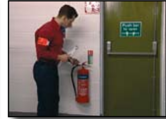
Fire Marshals - The Front Line of Defence