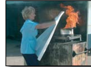
Fire Safety for Hospitals and Care Homes: Part 2